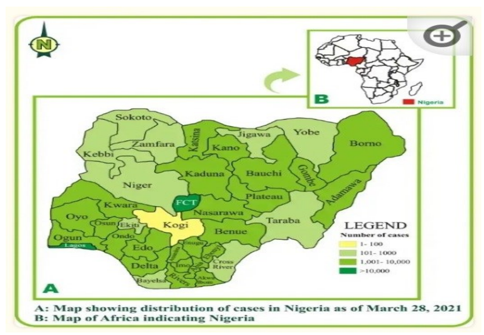
Figure 1: Map showing distribution of COVID-19 cases in Nigeria as at March 2021